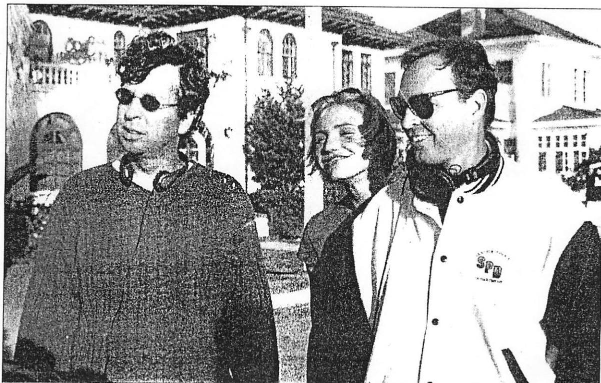
Actress Cameron Diaz peeks over the shoulders of Peter (left) and Bobby Farrelly on the "Mary" set.